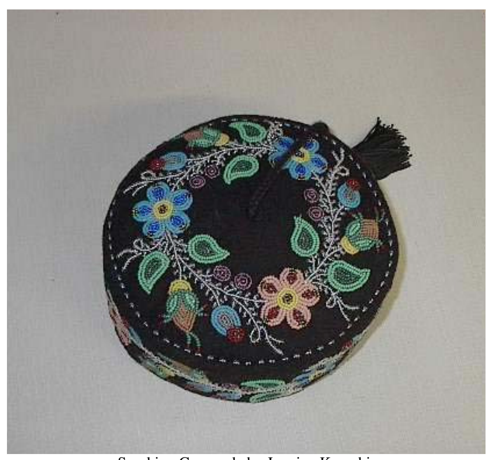
Smoking Cap made by Jennine Krauchi