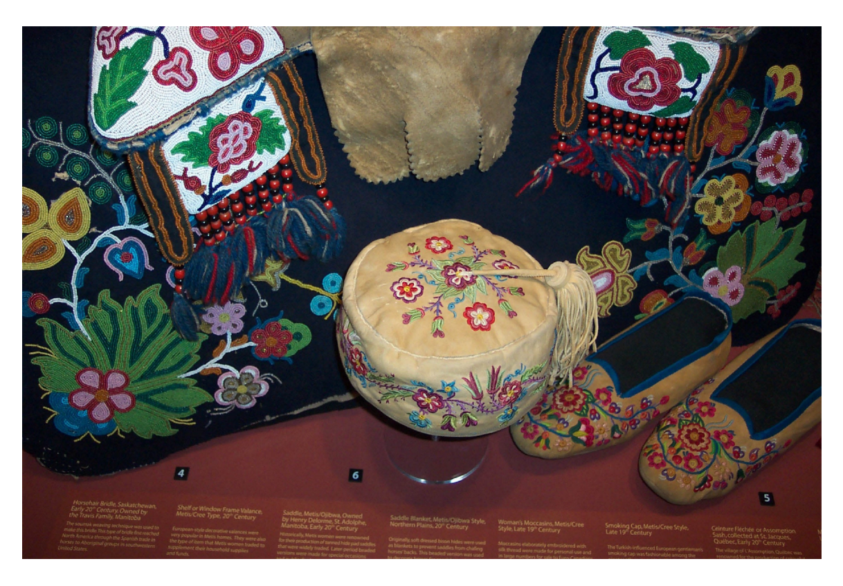
Manitoba Museum beadwork exhibit, smoking cap (centre) pad saddle (top).